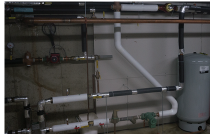
The mechanical room houses the solar thermal components except for the thermal mass storage tank, which is on the other side of the pictured wall.