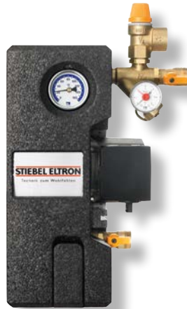
Flowstar Pump Station

Pump Station | Stiebel Eltron Pump Stations are specially designed for closed loop solar systems. The 3-speed Wilo circulator pump is designed to perfectly integrate with our SOM 6 Plus controller. Pump station piping is high grade brass. Pump stations come preassembled with a steel wall mounting bracket and feature 2 drain valves, brass check valves to prevent thermo-siphoning, integrated flow meter, and include fittings for tank mount as well as NPT adapters. The pump station can be completely isolated from the system, so no draining is necessary during servicing.