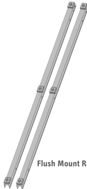
Flush Mount Rail System